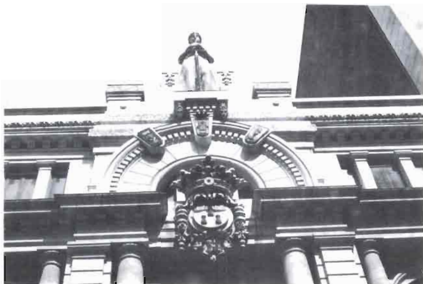
COLEGIO NOTARIAL (Detalle)